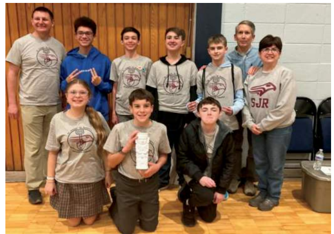
2026 Robotics Team