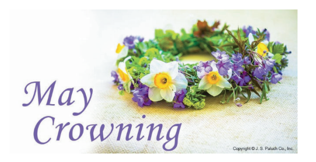
May Crowning -Sunday, May 11 at the 11:30 Mass *note change of date and time

If you are a returning family , please <u>do not</u> fill out a form. You will receive an email from Parish Giving. This email will contain login credentials for a Parish Giving account that was created for you. There is no need for you to create a Parish Giving account.