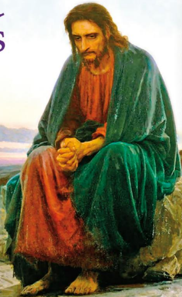
Ivan Kramskoi Christ in the Wilderness 1872