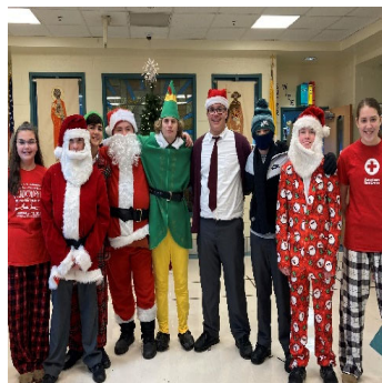
8 th Graders