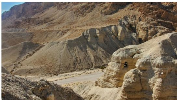
Qumran Dead Sea Scrolls