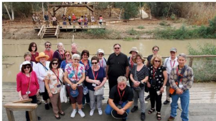
At the Jordan River