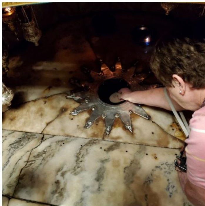
Birthplace of Christ