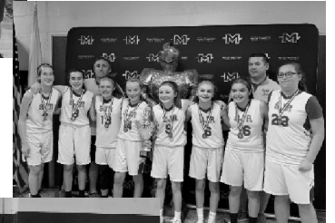
CYO Regional Team - Archdiocese of Philadelphia Region 11 Champions