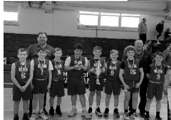
CYO Regional Team - Archdiocese of Philadelphia Region 11 Champions