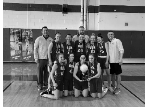
Congratulations to St. Joseph/St. Robert CYO Girls Basketball team on their Archdiocese of Philadelphia championship win!