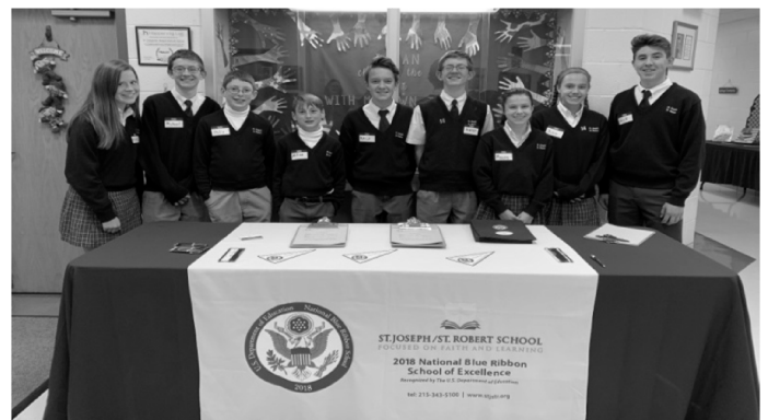
Our 7th & 8th grade students preparing to welcome and tour interested families.

Our highest priority is empowering your child for the future through a strong faith, education, and service! Call us today!