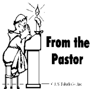
From the Pastor

Finally, we are investigating our options for repaving the parking lots. If anyone has any expertise in this area, please see me. One of the things we are considering addressing is the format for parking and exiting. Some have suggested moving the two large dumpsters and the yellow barricades in order to allow cars to move from the lot closest to the church into the back parking lot where they can exit onto Valley Road. This would require putting in a gate that would only be opened during Mass, and then closed for the rest of the week to keep people from using our lot as a “pass thru.”